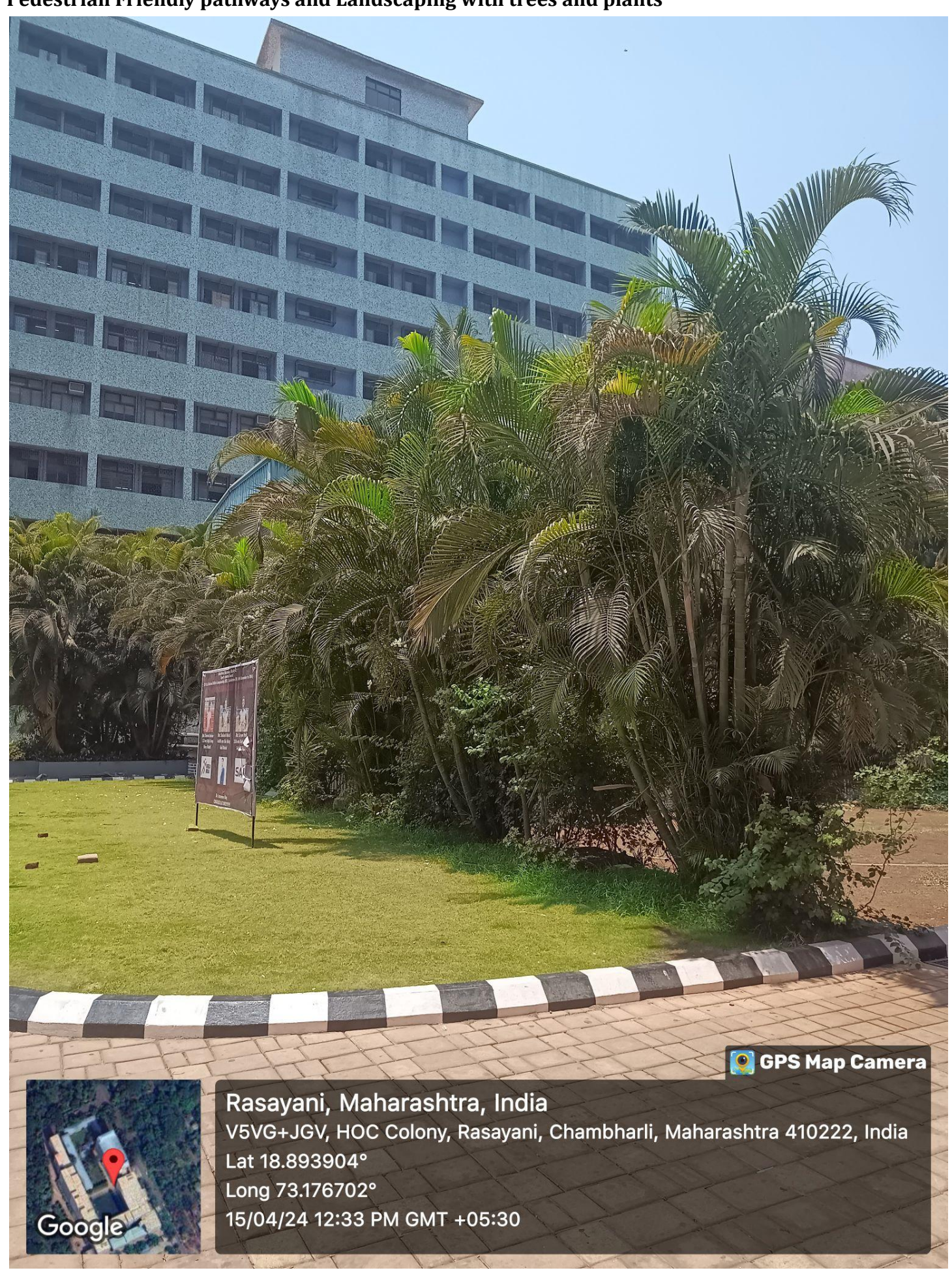
Pedestrian Friendly pathways and Landscaping with trees and plants