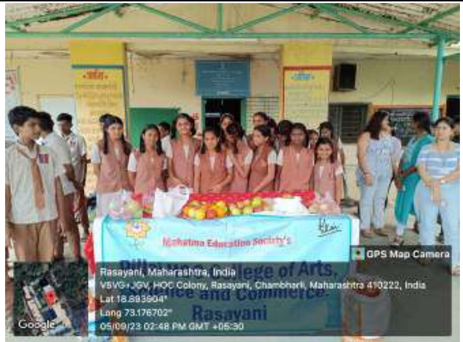
(Students at ZP School, Gulsunde)