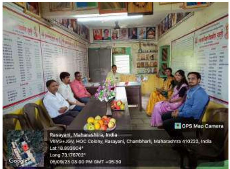
(Interaction with ZP School staffs)