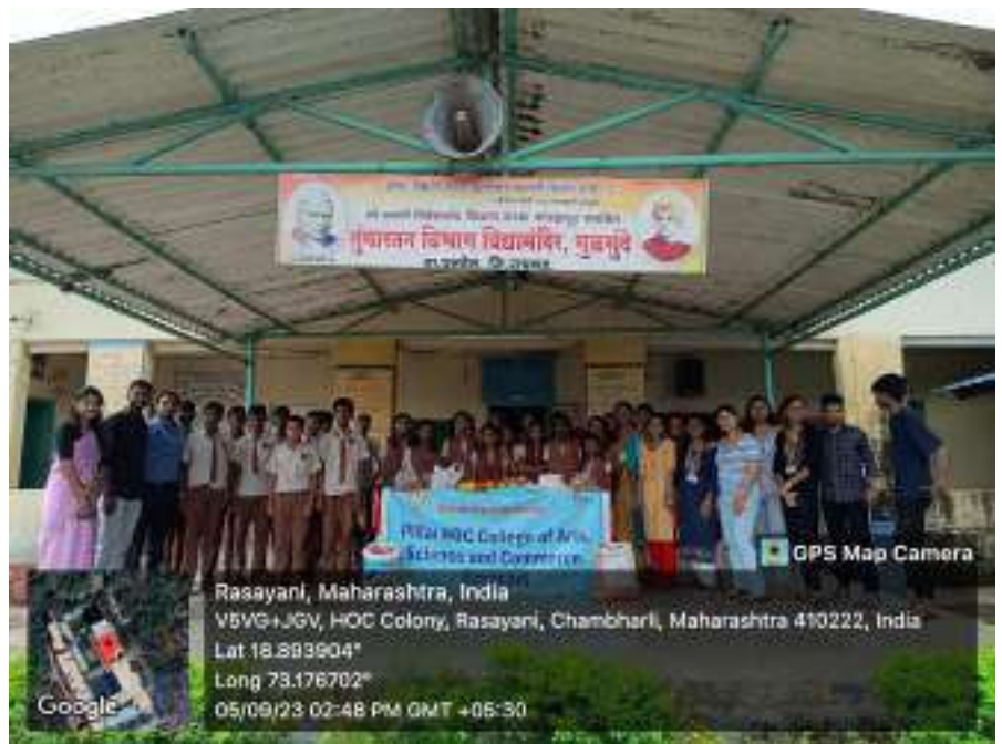
(Students at ZP School, Gulsunde)