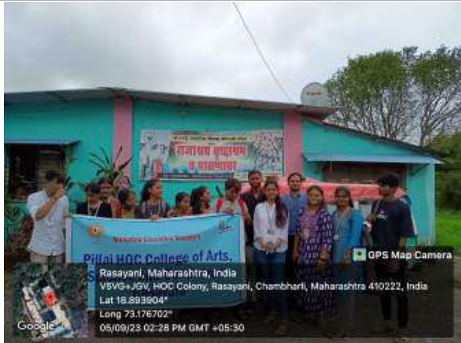
(Students at Old AgeHome )