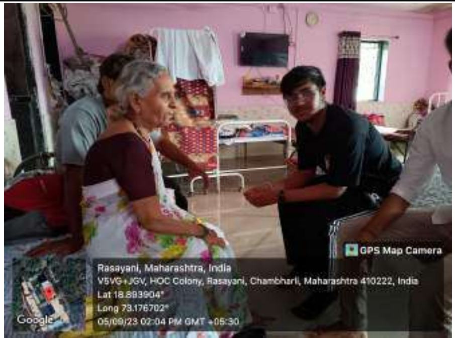
(Students interaction with residents)