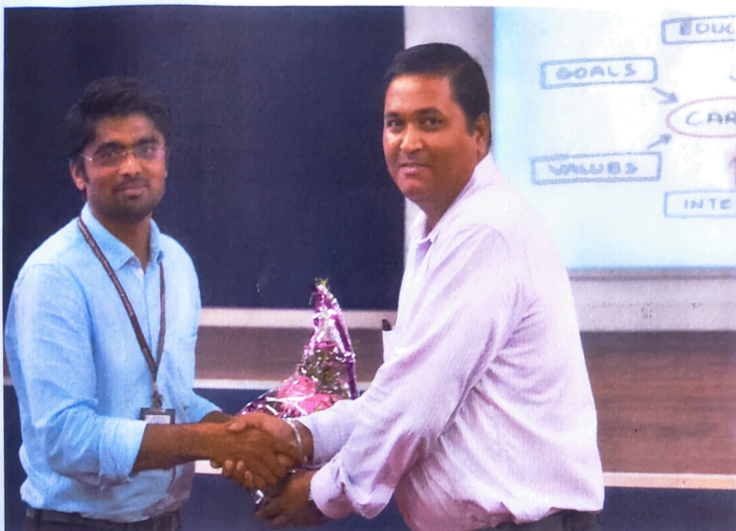
Felicitation by Vice- Principal