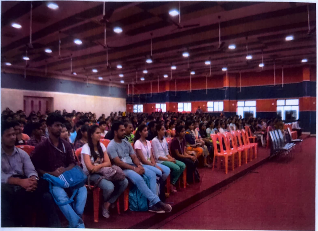
Grasping the points