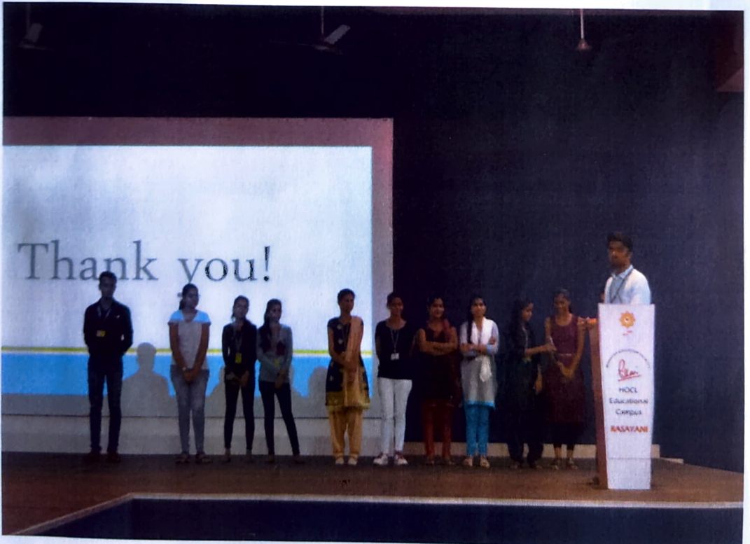
Enthusiastic students coming forth