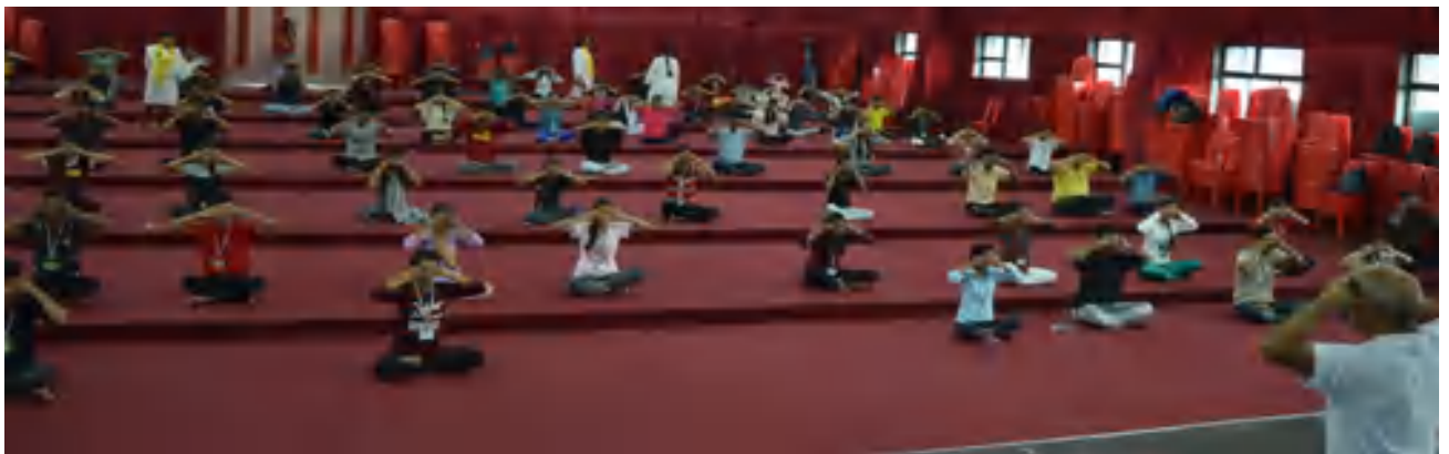
(Students performing mudras and asanas )

After Asanas session students were also taught the Pranayama . At the end of the session Principal appealed the students to include yoga in their daily routine for its wholesome and salubrious effects on the mind, body and soul.