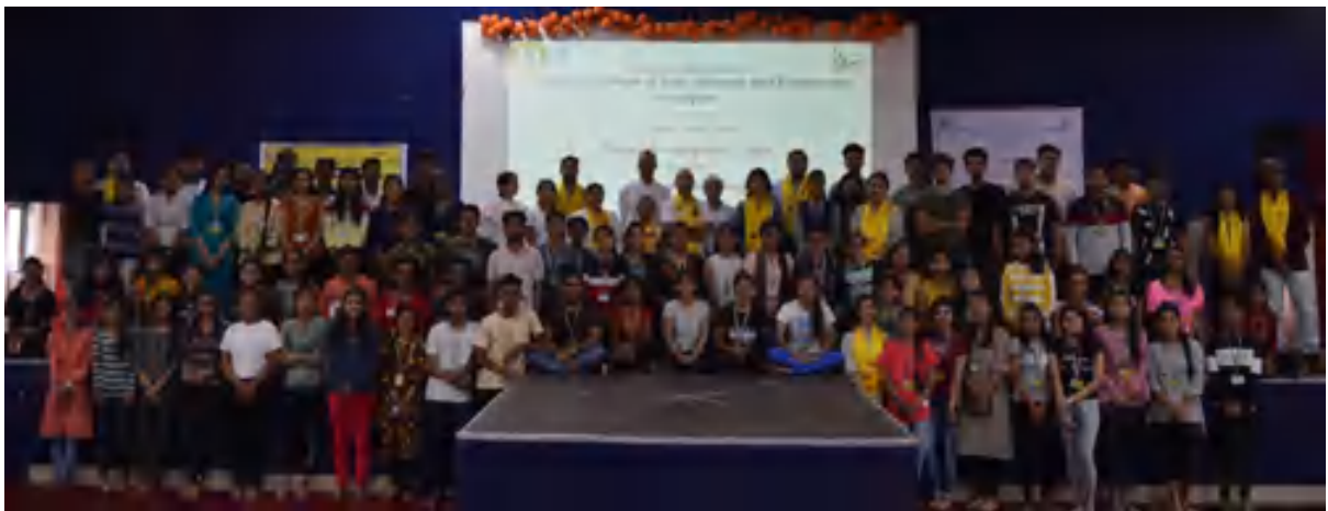
(End of the workshop)