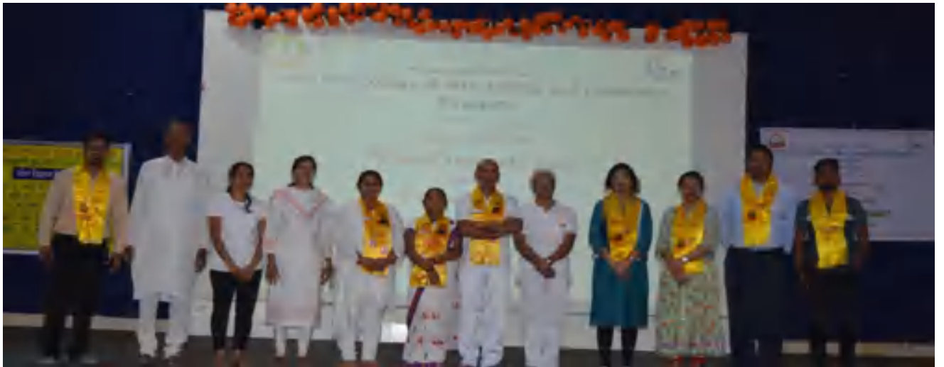
(Patanjali yoga team with Principal and Vice Principal)